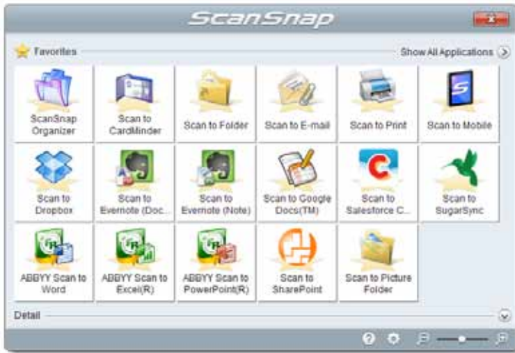
Quick Menu for Windows® shown

The ScanSnap Quick Menu for PC and Mac automatically pops up after scanning to provide you a variety of ways to be immediately productive with your scans. It can be easily customized to display just your favorites, present a recommendation, and even display custom profiles.