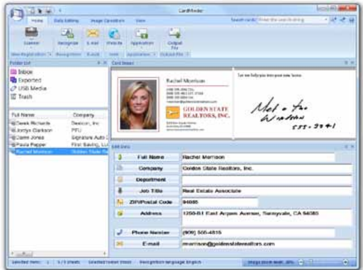
CardMinder for Windows® shown

Scan, store, and edit business card information with the bundled CardMinder software for Mac and PC and even export data into other applications like Address Book, Excel, and Salesforce.